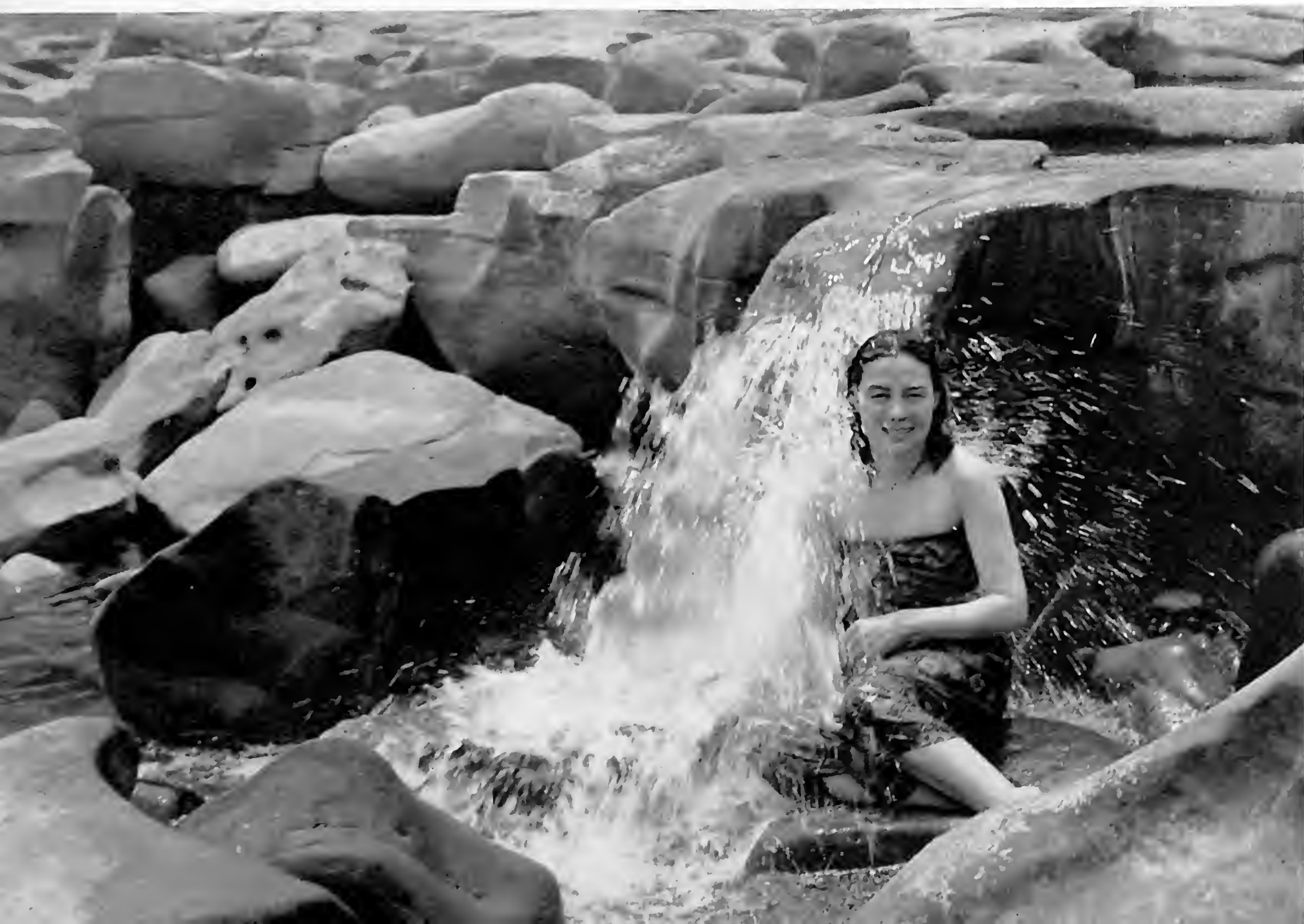
Washing off the fatigue of the journey in a stream of the free motherland.